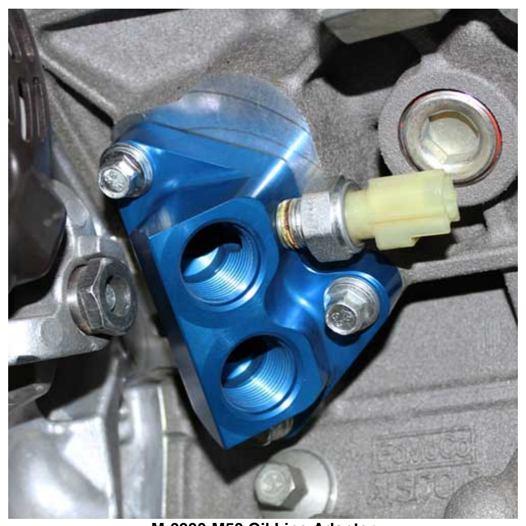
M-6880-M50 Oil Line Adapter

Warning: Oil filters have an internal one-way check valve. If oil lines are hooked up backward, oil flow to the engine is stopped. Engine failure will result.