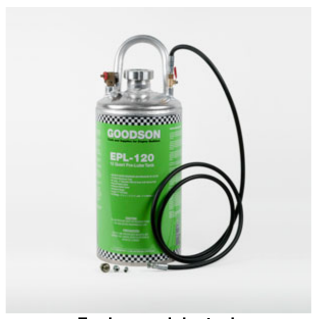
Engine pre-lube tank

The 5.0L DOHC engine must be primed with an engine pre-lube tank. Unlike the earlier pushrod engines, there is no oil pump driveshaft to rotate and prime the engine. Priming ensures that there is oil in all the critical areas when you start the engine. Do NOT prime the engine by cranking it!